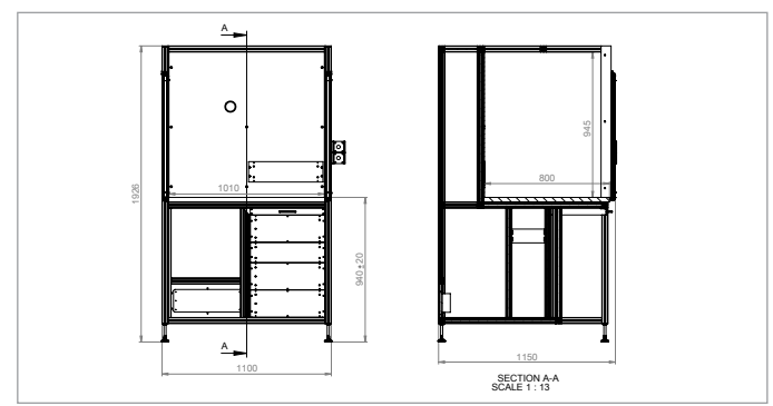
Test cage PK 7000A with light curtain and displaced foot space