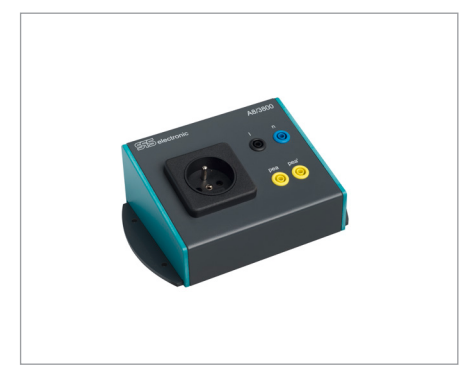
Connection panel A8 / 3800