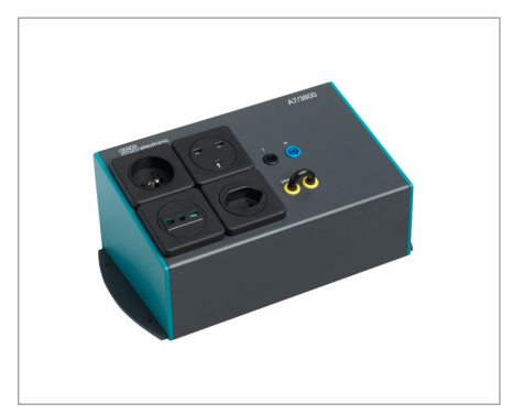
Connection panel A7 / 3800